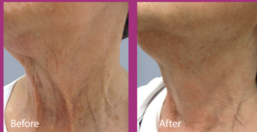
Dr. T. Loeb

Fractora achieves full-scale treatment depths with tunable fractional energy to improve superficial skin tone problems (photo damage) to deep textural concerns (wrinkles, acne scarring and skin contraction).